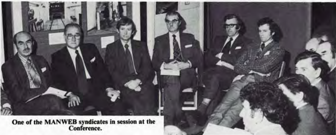
One of the MANWEB syndicates in session at the Conference.

Turning to the electricity industry's public image, Sir Francis said that we had considerable difficulties with sections of the press, and especially with TV. We were often misrepresented in the national press and a lot of damage resulted. (continued on page 4)